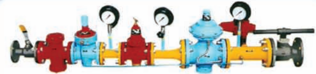
TWO STAGE PRESSURE REDUCING UNIT